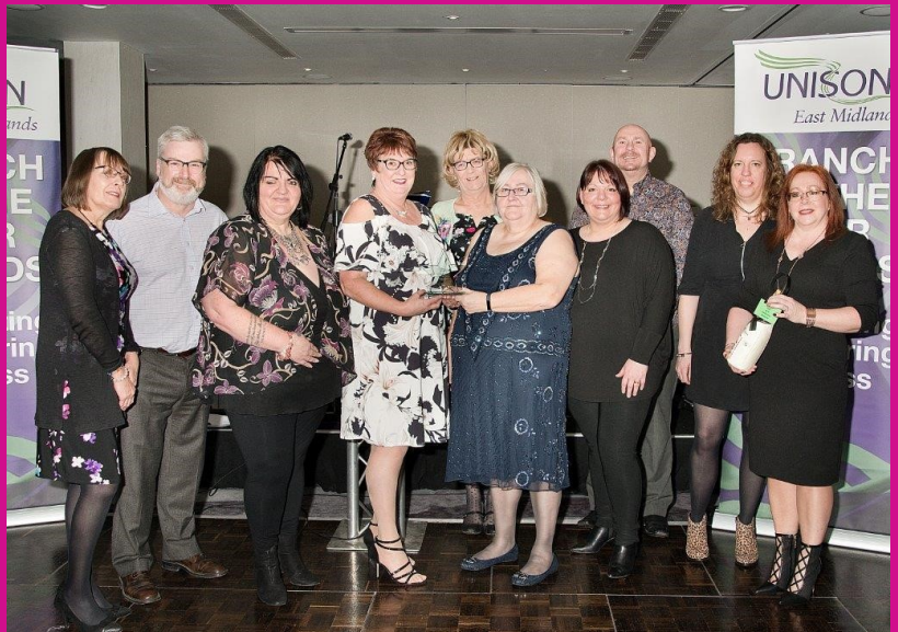
Derbyshire UNISON representatives collecting their award for winning the east midlands Best Learning Branch of the Year 2018

Help us help you Complete the questionnaire inside