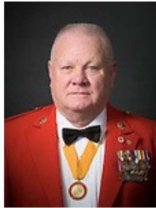
Message From Our National Commandant