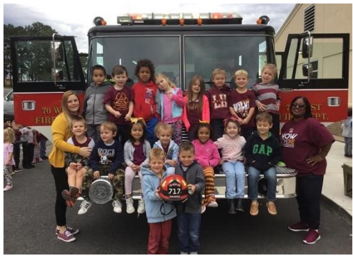
PICTURED ABOVE: FIREFIGHTERS CONDUCTED A FIRE PREVENTION PROGRAM FOR KIDS AT LAKE HAMILTON SCHOOL.

At 70 West Fire Department, it's more than just about putting out fires. We provide fire prevention services available to local businesses, educational facilities, and organizations. This is accomplished through pre-fire plans, inspections, safety presentations, fire extinguisher training, and much more. Pictured at the top of the newsletter, some of our volunteers set up recently for a Safety Day at Walmart Neighborhood Market. They talked fire safety with kids, showed them the truck and equipment, and handed out candy. They talked with community members about our department, our equipment, services we provide, and more. We have also done Safety Days over the last few months at