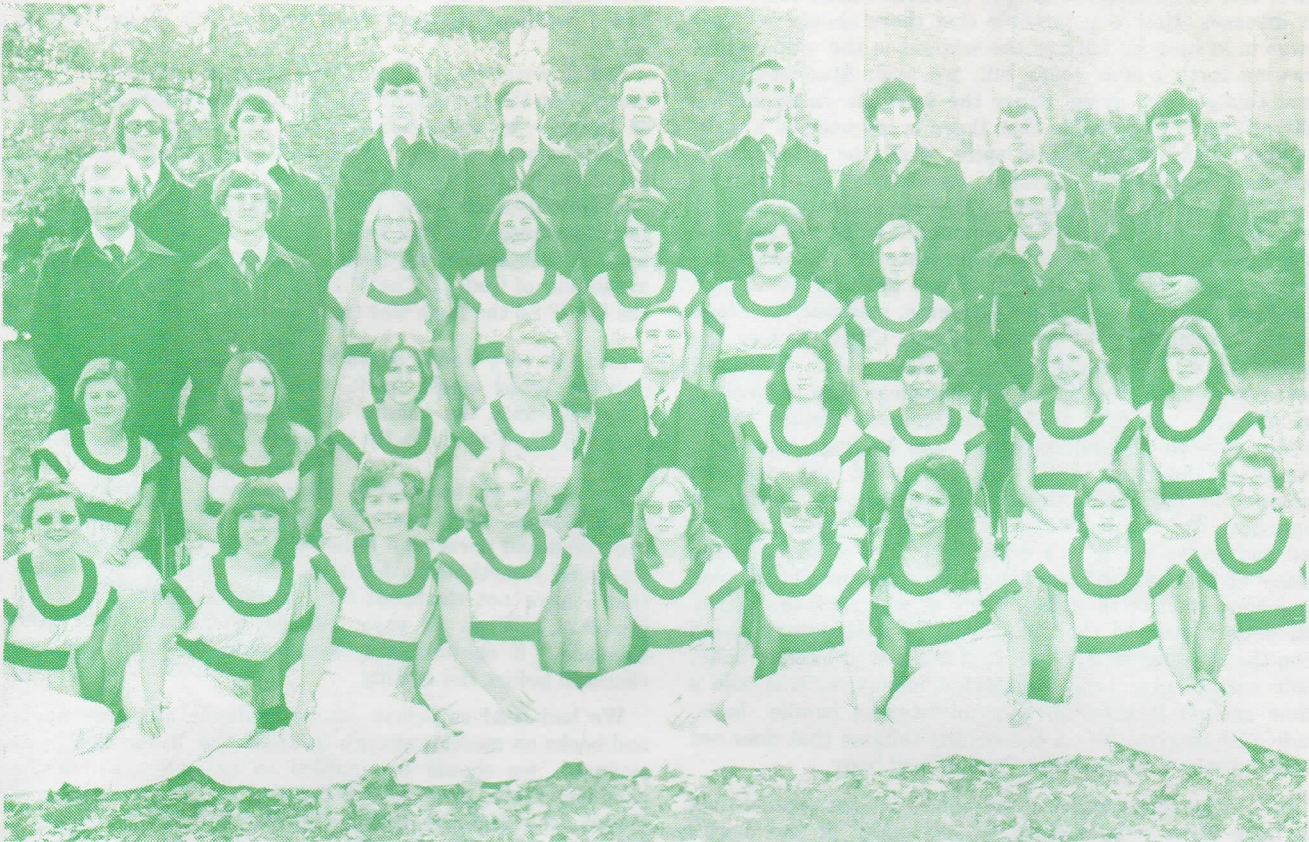
1976 AFBC CHOIR

Non Profit Organization U. S. POSTAGE PAID PERMIT No. 37 Galena, Kansas 66739