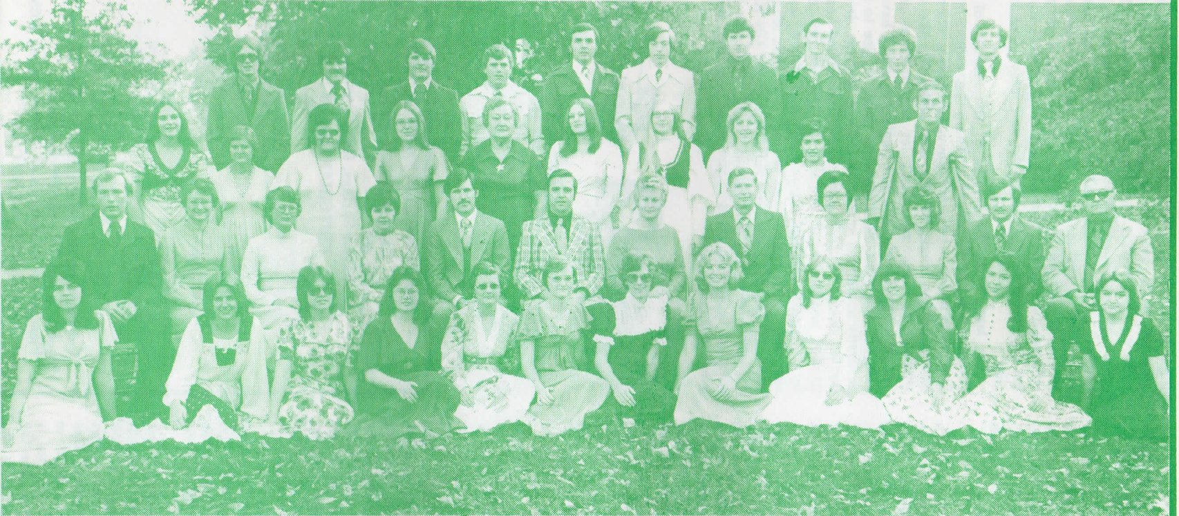
AFBC 1976 STUDENT BODY & FACULTY