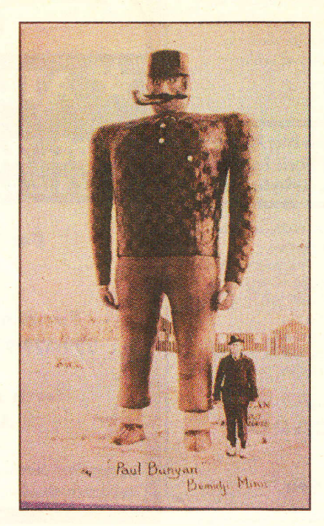
Probably the first postcard of the Paul Bunyan statue in Bemidji, postmarked 1937.

Exaggeration to prove a point has seemingly been a factor in America's visual and storytelling heritage forever, and postcards have long depicted the story, but here in rural America the concept takes on particular meaning. Communal celebration, local identity, and civic pride have a lot to do with it. Small towns like to think of themselves as being worthwhile. Their citizens, straightforward but special, in an attempt to give feelings reason, vote to erect giant colossi commemorating just about anything. Ordinary people populate these towns, and their boosterism of showing off the biggest and the best is integral to the American vision. And where boosters reign, competition is never far behind. The Minnesota State Fair is a good example. Highlighting the biggest fruits and vegetables, it is