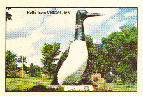
The Loon is Minnesota's state bird.

towers over the landscape. Invented in 1925 as the trademark for peas packed by the Minnesota Valley Canning Company, today he is well-known for an assortment of vegetables packed by the Green Giant Company in Le Sueur. The former, a giant of logging, and the latter, a giant of processed vegetables, help to give visual presence to the Midwestern reality of Minnesota as a land of plenty.