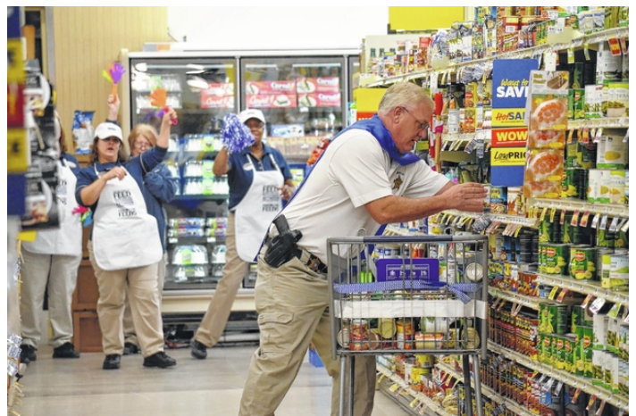
The "High Sheriff" in pursuit of food to feed the hungry!

We would like to thank all the participants in this event. The foods gathered were shared among the Northern Stokes Food Pantry, East Stokes Outreach Ministry, and King Outreach Ministry.