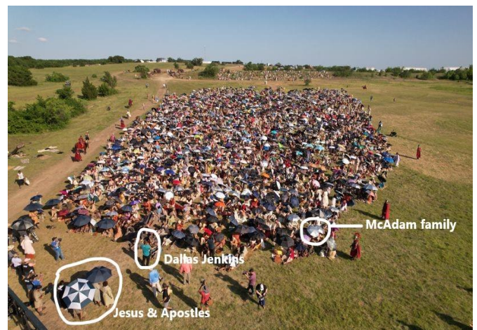
Overhead shot of crowd with family circled.

The enormous undertaking led to not 5,000 people, but an estimated 12,000 men, women, and children from 36 countries and all 50 states, who traveled at their own expense to Texas for