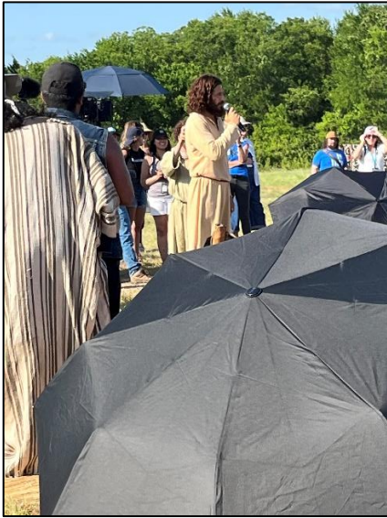
Click the image to hear his speech.

“Many of you know my own story and my need to surrender in my own life: four years ago, everything changed. I went from being completely broke, without any options, without any vision as to what was going to happen, how my career was going to go, how my life was going to move forward,” he said.