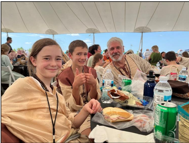
Lunch: one of the many ways The Chosen folks cared for the extras.

The Chosen took excellent care of the extras on a day that saw temperatures climb into the high 90s with elevated humidity. At the outdoor staging area, they provided tents, lunch, water, restrooms, and entertainment by top names in contemporary Christian music.