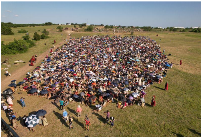
Day one of filming: Overhead shot of crowd.

Extras were required to put together first-century apparel free from buckles, zippers, buttons, modern-day fabrics and colors, and the like. Head coverings were a must for both men and women. Most of the men, including my husband, grew out their beards, a first for many of them. For the filming, extras couldn't have visible tattoos, piercings, unusual hair colorings, and the like.