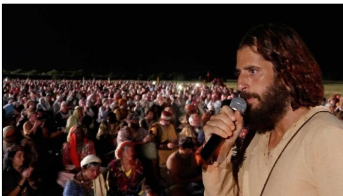
Click image to view the Our Father being prayed in Aramaic.

The second day of shooting included filming in the dark with groups of extras huddled around campfires. When “Cut!” was called for the final time, Roumie asked if he could pray the Our Father for the crowd. In a moving witness to his Catholic faith, he made the sign of the cross and then recited the prayer in Aramaic, the language which Jesus spoke and would have prayed this prayer.