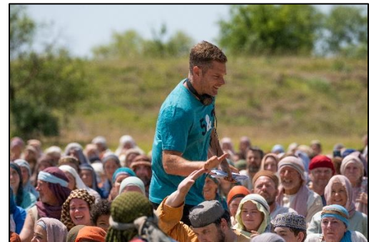
Dallas Jenkins greets the crowd.

Participating in The Chosen spiritually fed our family, and the prayer of all the extras is that the series continues to nourish millions around the world, for The Chosen is more than just excellent entertainment. It’s an opportunity to evangelize. Some do it on a grander scale than others, but as Jenkins told us that day: “It’s not your job to feed the 5,000, it’s only your job to provide the loaves and fish.”