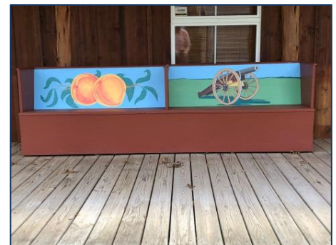
FHS Students Complete the First Pew