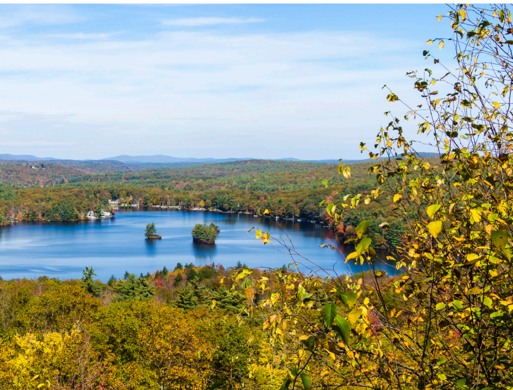
View of Stodge Meadow Pond, Ashburnham Ted Hoosick