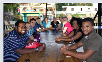
Ball State Mission Group

The summer program at Caribbean Mountain Academy was a great success. Four teenagers participated in the 8-week program from June through August, experiencing spiritual and therapeutic growth through weekly counseling, community service, and faith-based activities. These teens had the summer of a lifetime with our amazing staff, who reminded them daily just how much Jesus treasures them!