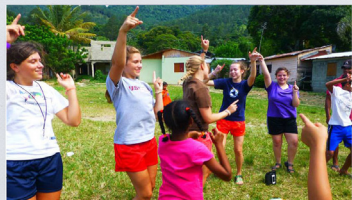
VBS with the local children