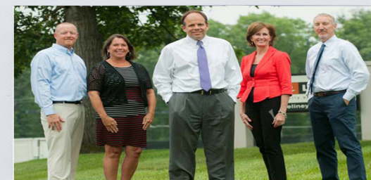
Crosswinds in Fort Wayne Living