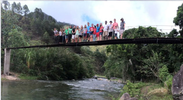
New Bridge in the D.R.

Nine mission groups have visited this summer. These teams helped construct a bridge that stretches over 200 feet. Now, over twenty-five families can easily cross the river to go to the market.