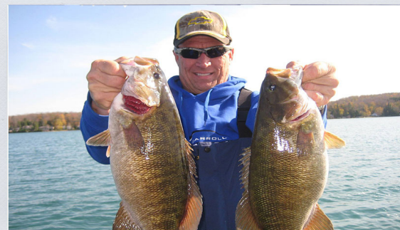
Fish with the Pros

Money raised during this unique event goes to helping kids and families who need help getting on the right path. Through counseling, education, and sometimes even residential care, Lifeline gives individuals and families the tools to meet their goals and avoid the need for future court intervention.