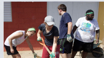
Putting in a new floor