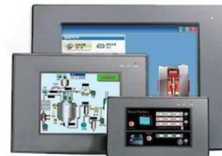
controls & automation