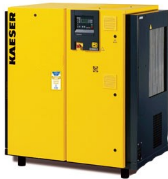
air compressor to pumps and valve operation, to be sourced locally