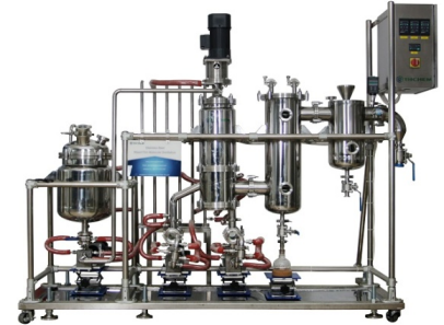
short path distillation unit & evaporator