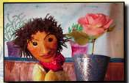
This is Manito. He is the main character in the story of "The Gardener"