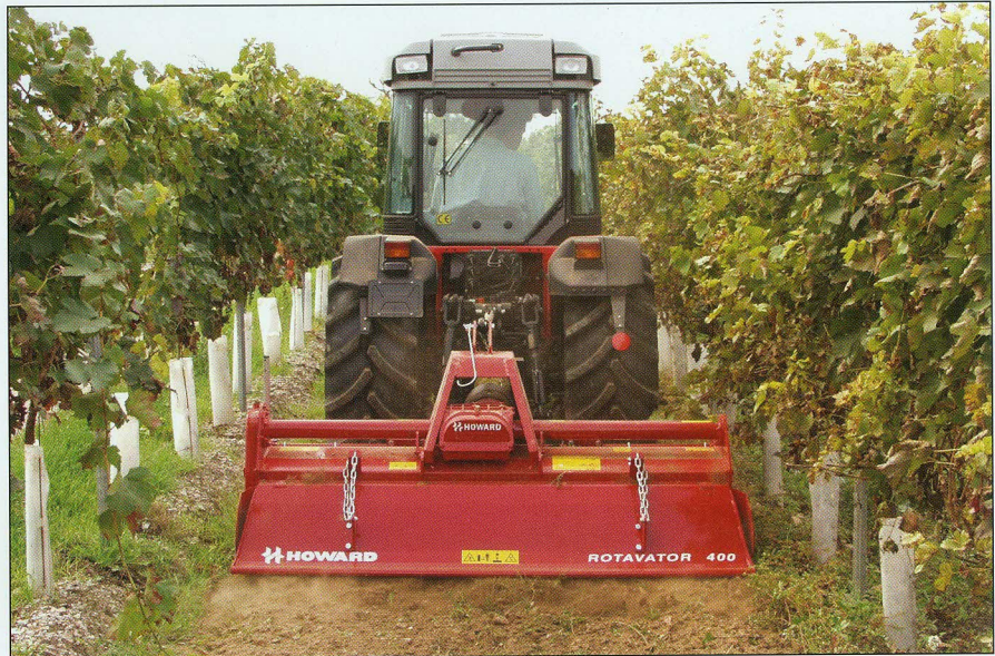
R400S-180M equipped with optional double tube and trailing board springs.

The heavy frame assembly is supported by a double tube assembly for greater stability. A durable gear side drive provides for the efficient transfer of power to a heavy duty 6 blade per flange rotor.