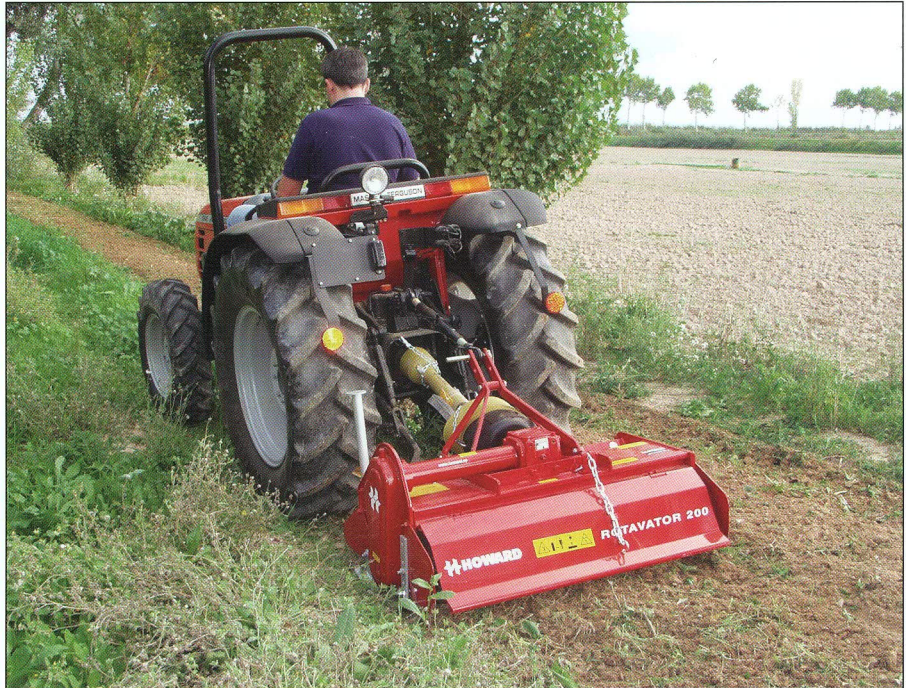
Rotavator 200-105. Specially designed for compact tractors.

Trailing board shape allows an even flow of soil and a level finish. Easy to adjust.