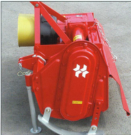
Chain side drive equipped with 1" chain.