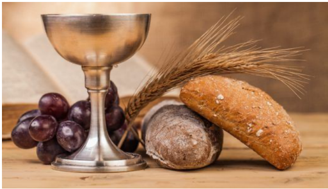
By: The Word Among Us

My flesh is true food, and my blood is true drink. (John 6: 55)