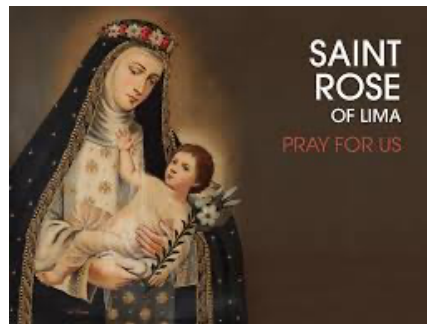
By Catholic Online

“Jesus, Bread from Heaven, nourish and sustain me all the days of my life!”