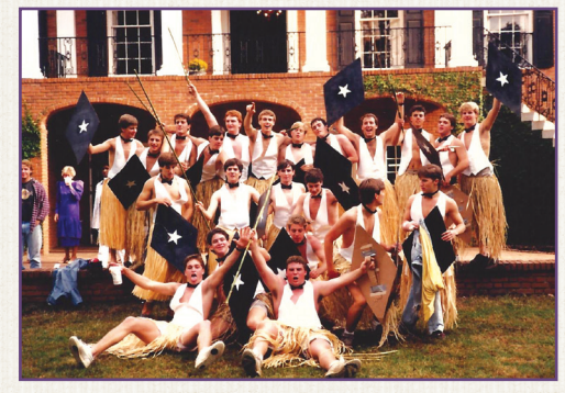
Brothers outside the Chapter House during their Fiji Island event.