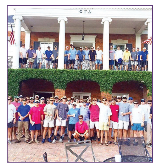
Brothers gather outside the Chapter House before an event.