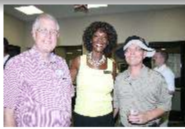
Thanks to the following for donating raffle prizes...