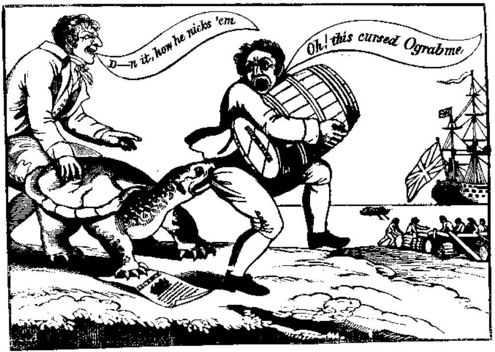
OGRABME, or The American Snapping-turtle.

Remember that the readers already know the documents inside and out... go beyond simple descriptions and quotes! TRY TO GO BEYOND THE OBVIOUS!