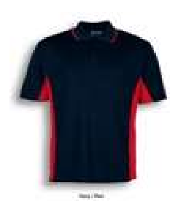
Sky blue/Navy Navy/Sky Blue Navy/Red