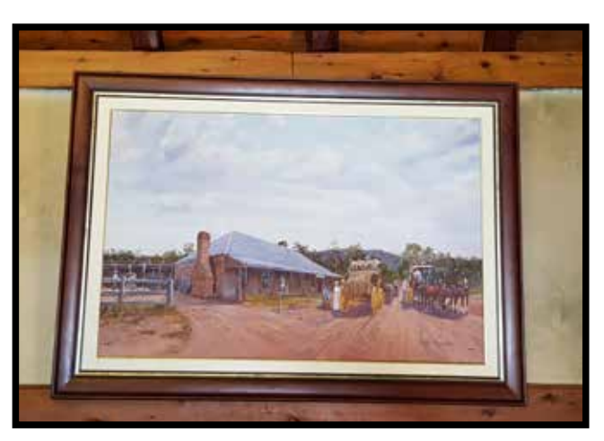
The Lion of Waterloo in it's Cobb & Co days

Each Coach was pulled by 5 horses and two more could be added when required. Cobb & Co bred their own horses.