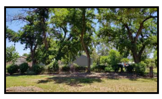
Across the road from the Lion, the site of the Cobb & Co stables.