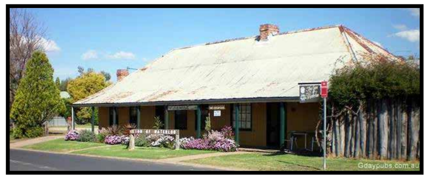
The Lion of Waterloo as it is today