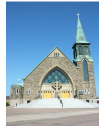
Saint Augustine's 340 Dominion Street Moncton, NB