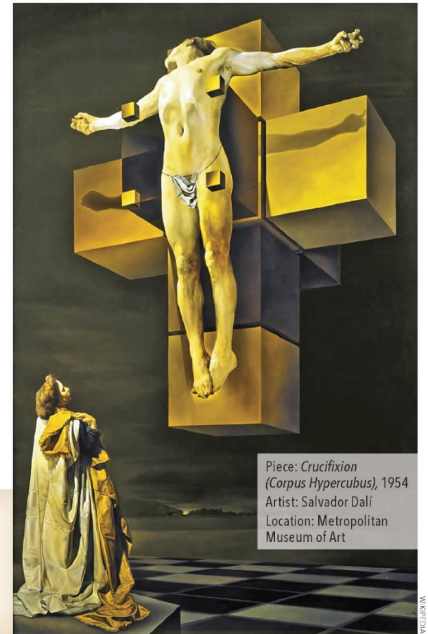
Piece: Crucifixion (Corpus Hypercubus) , 1954 Artist: Salvador Dalí Location: Metropolitan Museum of Art

How have you followed them? Should you get back to them?