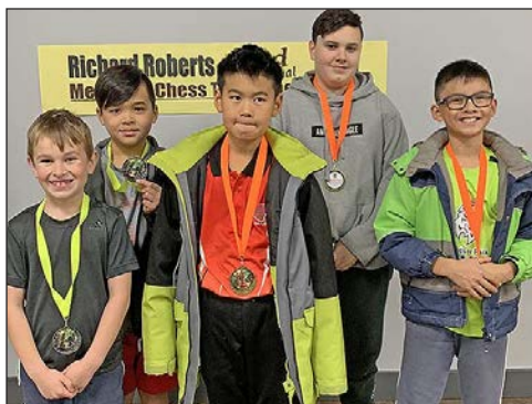
Section A Gold Medalists