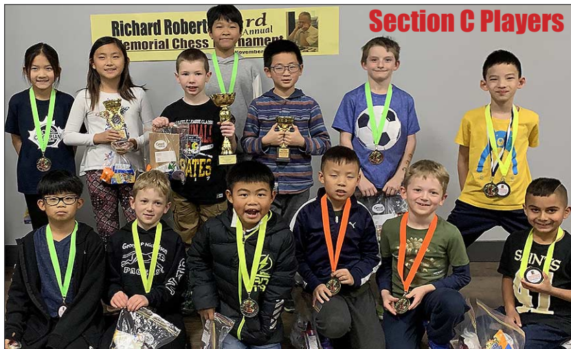
Section C Players

3rd Annual Richard Roberts Memorial Chess Tournament