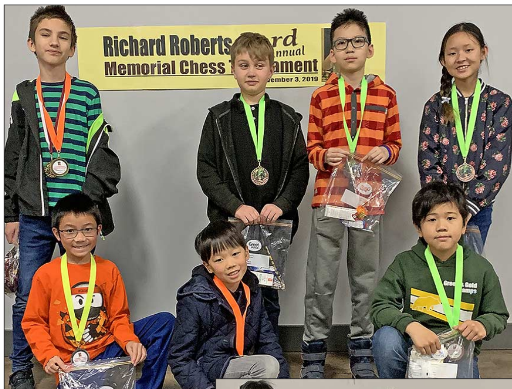
Above Section B Runners-Up Right, Section B - top finishers

Lower-rated sections of play will still get trophies and chess medals, but there will be a change in tournament draw prizes. Players involved in sections offering cash prizes will not be eligible to win draw prizes. Draw prizes will only be offered to the lower sections of competition and usually be more suitable for elementary-age or beginning level players.