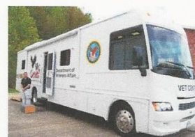
VA Mobile Vet Center