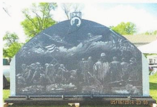
Hoosier POW/MIA Memorial Wall