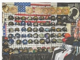
Ft Harrison Bunker Store