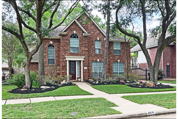
8830 ANDANTE DRIVE