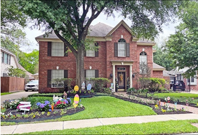
8010 SONATA COURT