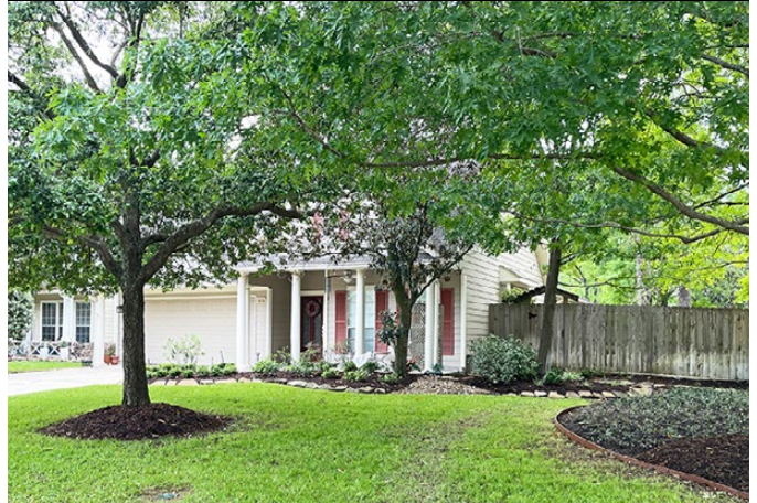
9515 MUSICAL COURT