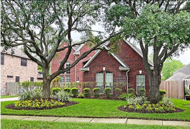
8623 PRELUDE COURT