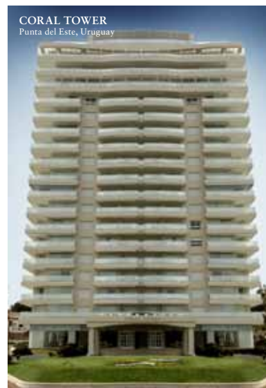
CORAL TOWER Punta del Este, Uruguay