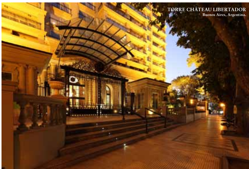
TORRE CHÂTEAU LIBERTADOR Buenos Aires, Argentina.