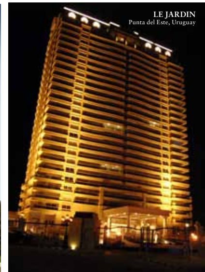
LE JARDIN Punta del Este, Uruguay