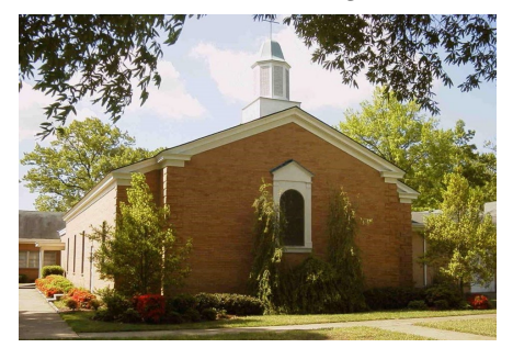
Written by G. Dziagwa

Visit us online at <u>http://</u> <u>www.aldersgatenorfolk.org/</u> for more information