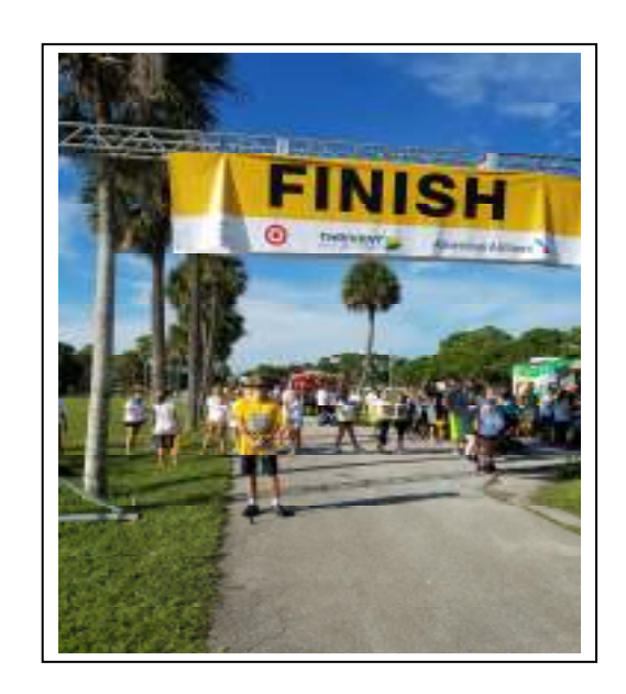
St. Jude's Hospital for Children, Walk Palm Beach 9/24/16 Thank you to all who supported us. The walk raised almost $100,000.