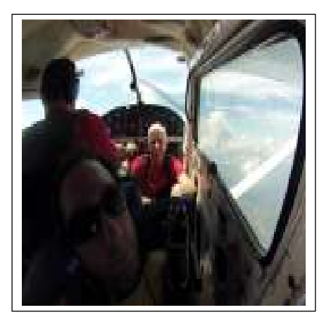
Perfectly good airplane