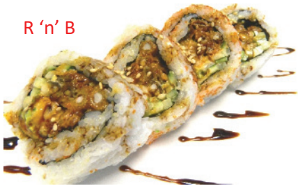
R 'n' B

24.R "n" B (4pcs) 10.99 soft shell crab, cucumber, avo, jalapeno, mac nuts, creamy spicy sauce