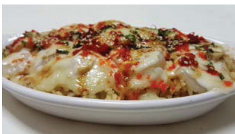
Fried Rice Baked Scallop with House Special Sauce