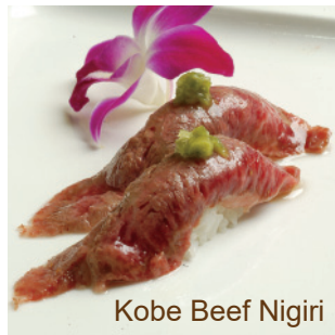
Kobe Beef Nigiri