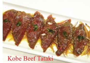
Kobe Beef Tataki