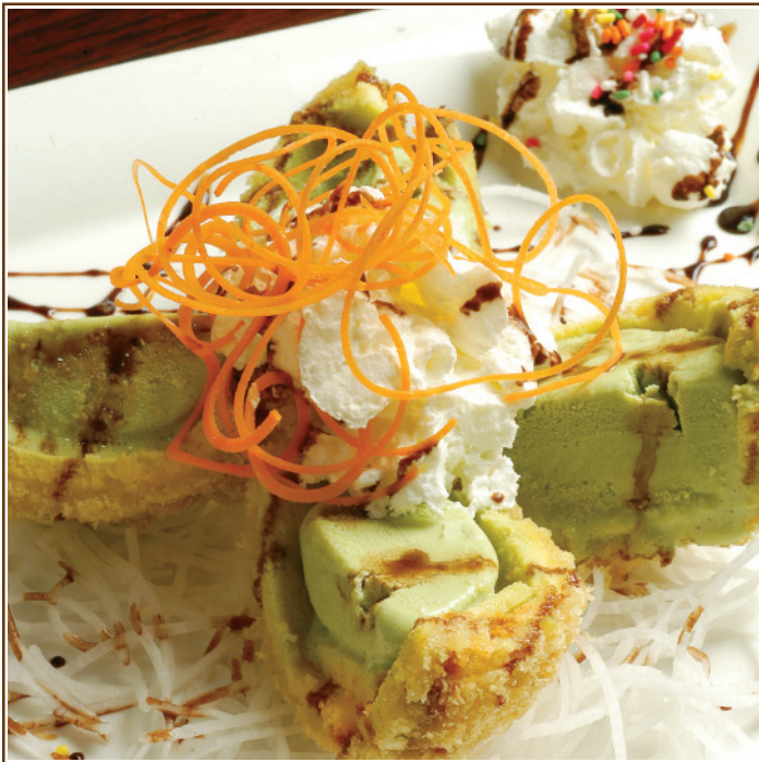
Tempura Ice Cream