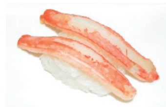
Snow Crab Leg