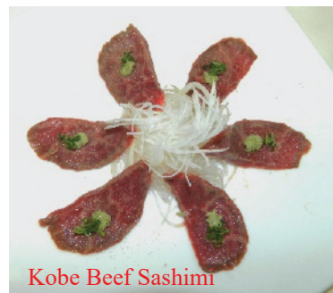
Kobe Beef Sashimi