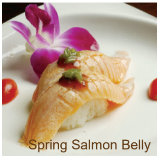
Spring Salmon Belly