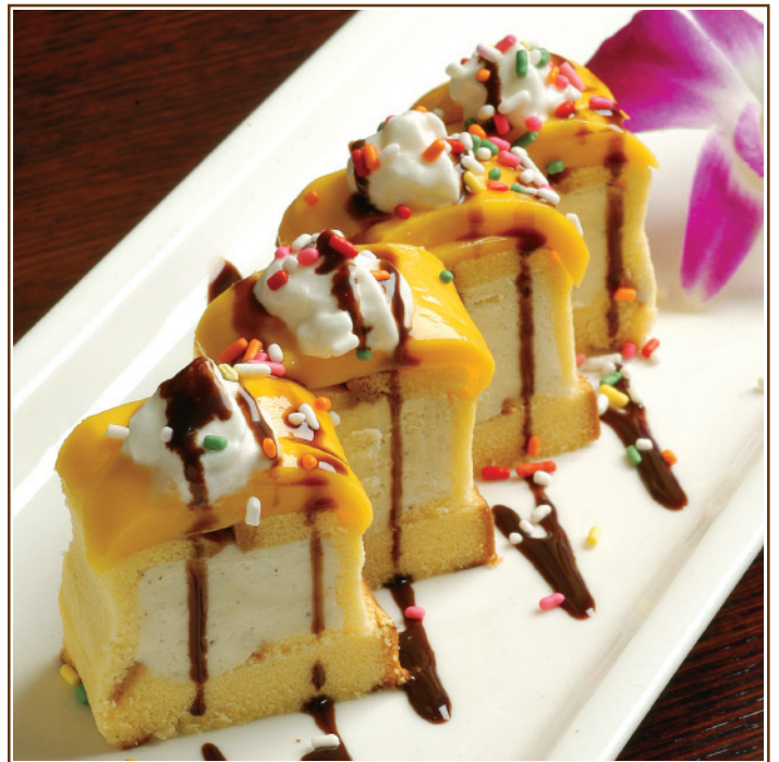
Sushi Ice Cream