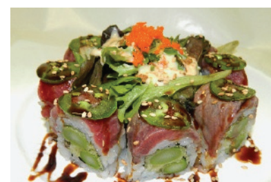
Kobe Beef Roll