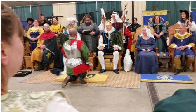
Award of Arms to Lord Cristoffel