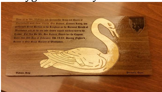
Cygnus for Lady Niemeau