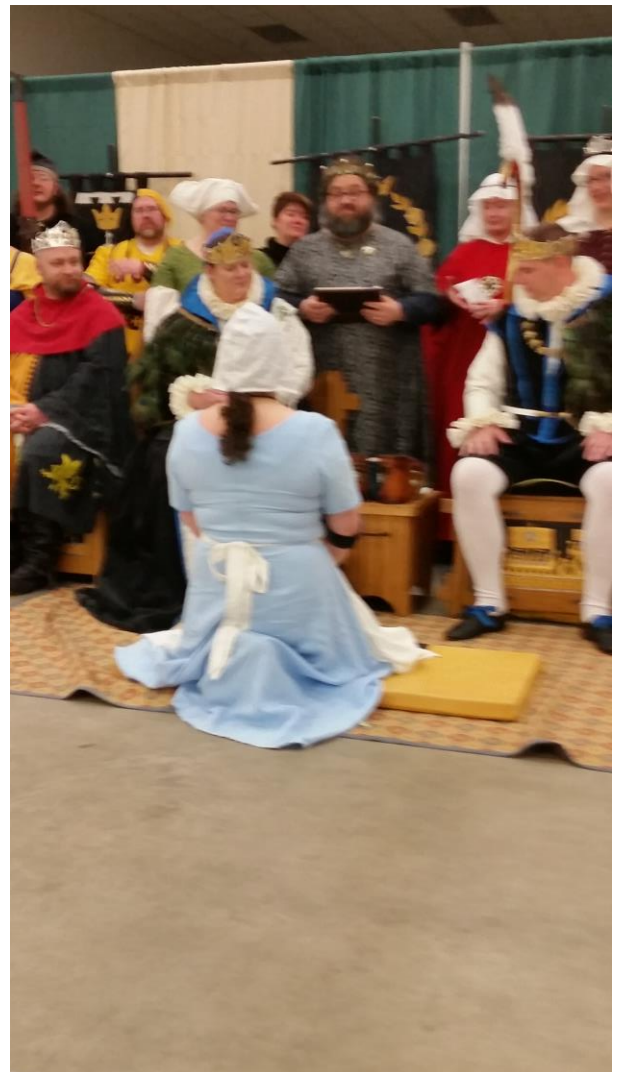
Cygnus to Lady Marketa