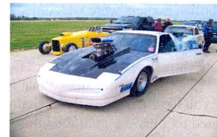
Geezer Racing's Race Car