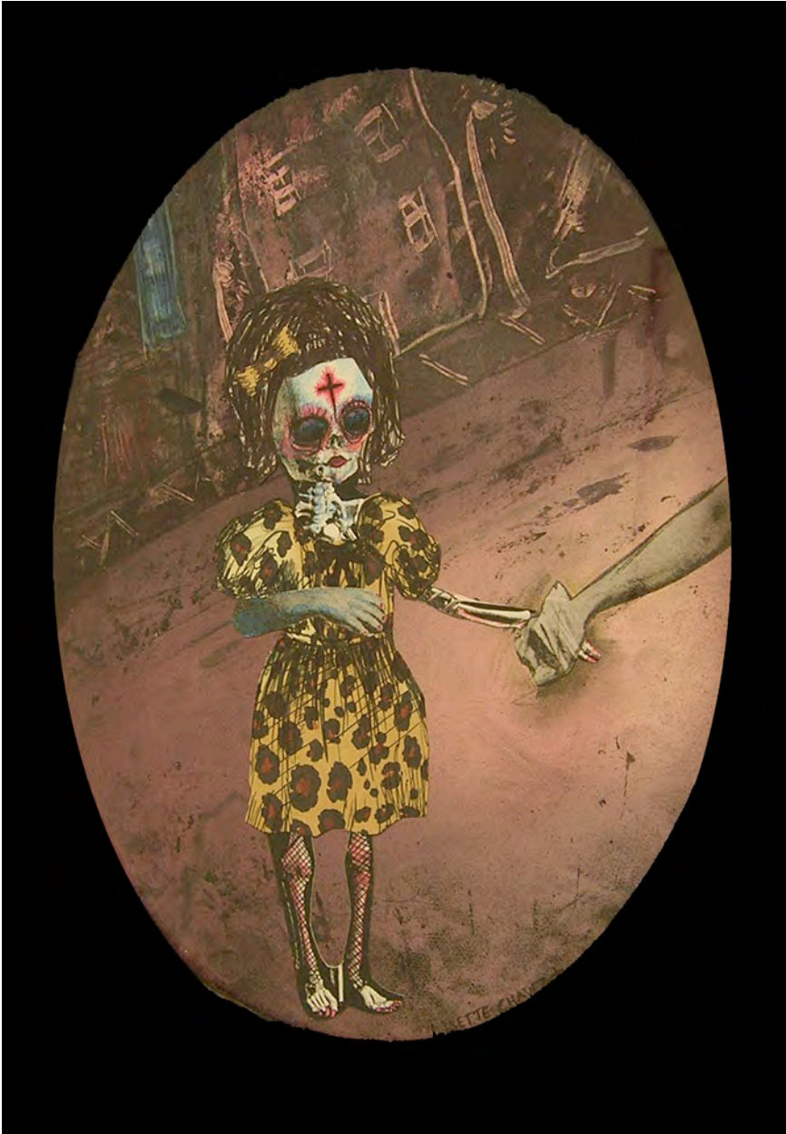
Little Trick Mixed Media