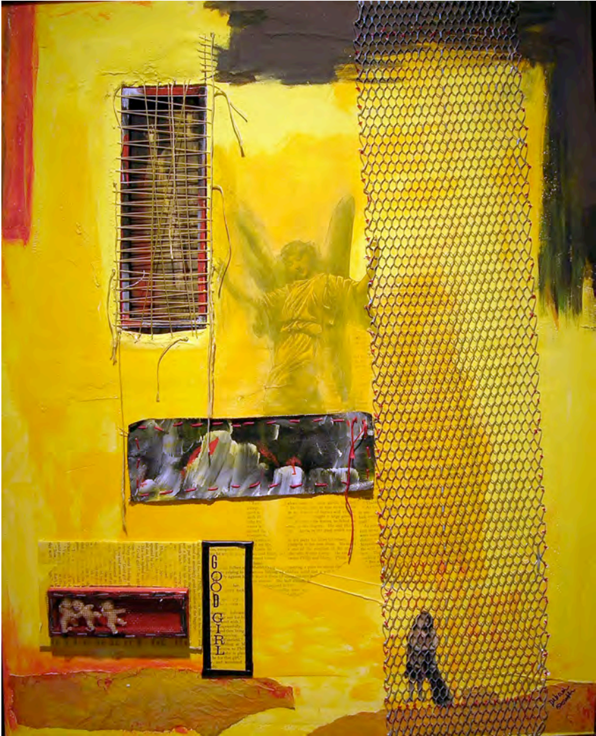
Good Girl Encaustic/Mixed Media