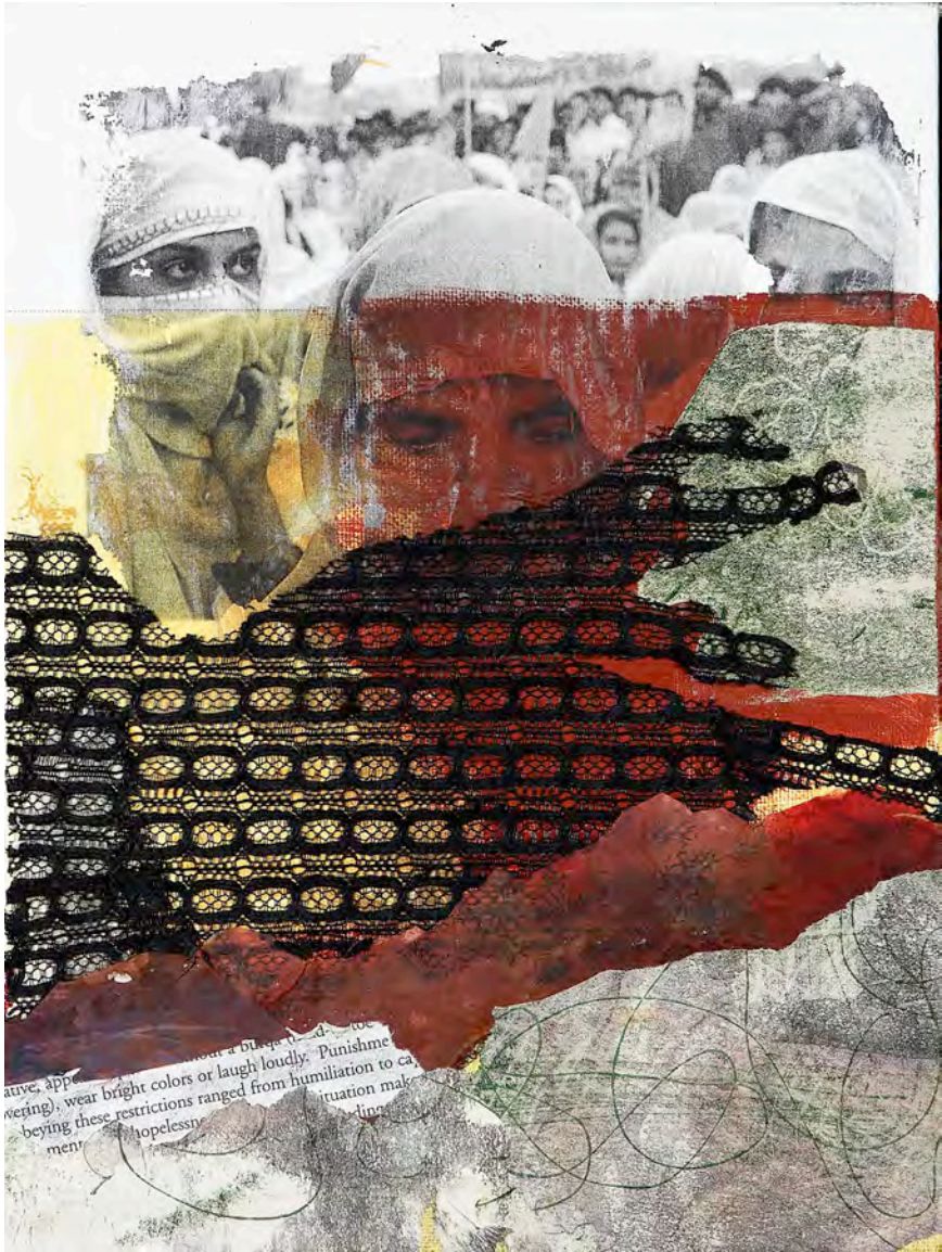
Veil of Silence #1 Mixed Media