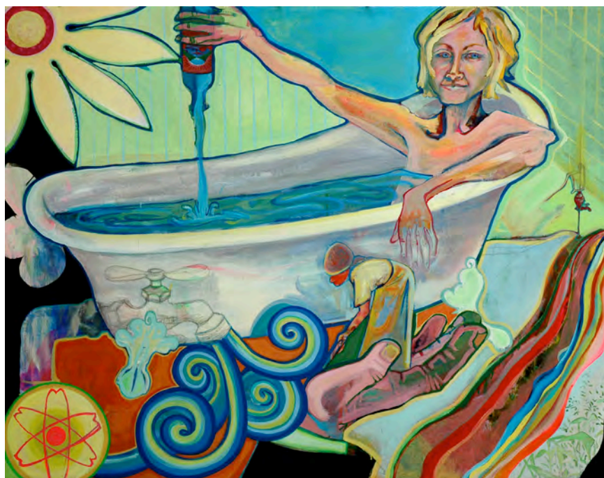
Kondo kwa Maji Acrylic