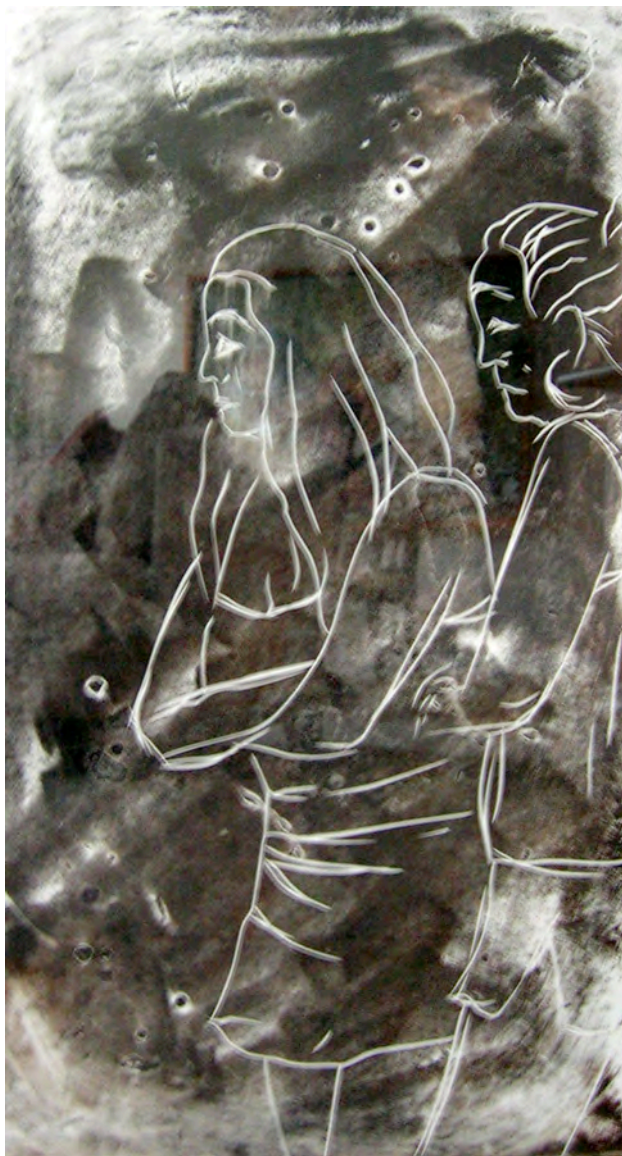
The Price of a Soul/My Mother, My Sister Linocut