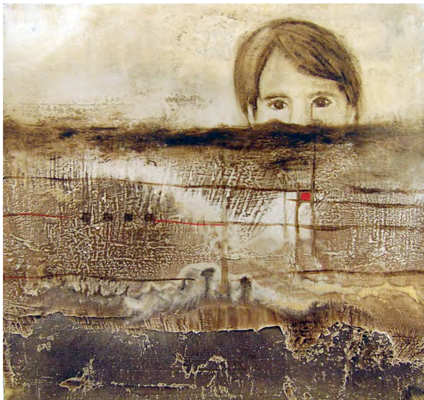
Llorando en la Oscuridad #1 Mixed Media