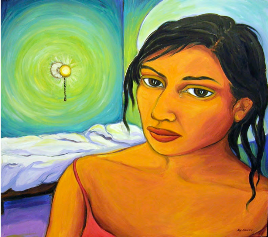
Alone with Despair Oil