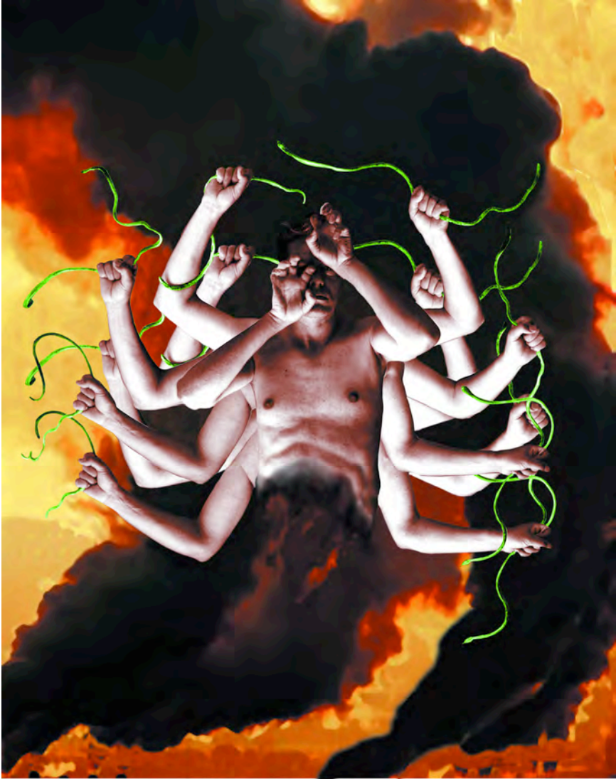
The Servant's Dream Digital Photo Montage