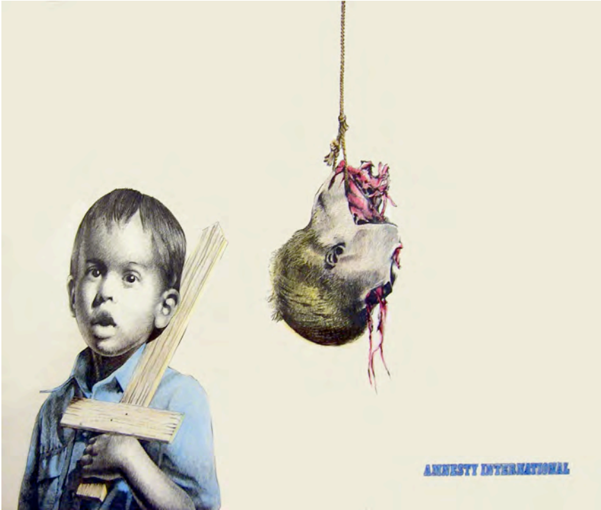
Without a Caption Color Lithograph