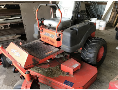
Bad Boy 72" Pro Series ADS 0-turn mower, well maintained, bought new