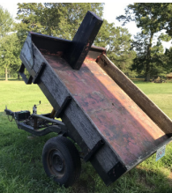
6'x7' hydraulic bed trailer