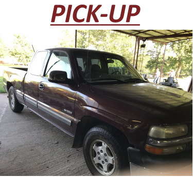
1999 Chevy Silverado 1500LS, ext. cab, auto, only 128k miles