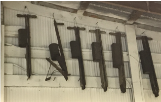
Several antique manual corn planters

Dining table, oak top 2 drawer metal lateral filing cabinet 2, 4, & 5 drawer metal filing cabinets Antique wooden office chair Mira-Cold & Whirlpool chest type freezers 2- upholstered office chairs Mission style oak rocker Book shelf unit 4 blue dining chairs on rollers Lg wooden desk Dresser, matching chest and end table 8 gun cabinet