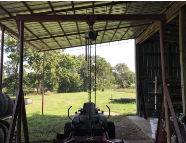
Coffing 1 ton chain hoist on portable 10x10' A-frame