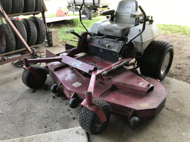
eXmark LazerZ commercial Trivantage 72" 0-turn mower Poulan Pro High Wheel push mower High Wheel push trimmer Echo CS-490 chainsaw Stihl MS 250-C chainsaw Lynxx leaf blower Shovels, rakes, pitchforks, etc 14 gal ATV sprayer