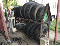
Tire rack 2- metal shop cabinets, w 18 cubbies, 3 divided shelves