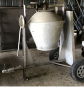
Cement mixer on wheels, electric Push lawnmower for parts Propane burner