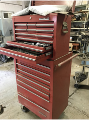
Waterloo 19 drawer tool cabinet

Boice Crane 6" jointer/planer Jet hor/vert band saw Clarke metal cutting circular saw, in case Craftsman radial arm saw Rockwell Contractors model 10 table saw Small compressor, 5 hp B&S engine Metal band saw Proteam HD 12 spd drill press, on metal bench, ¾ hp Chicago 12 spd drill press Master Mechanic wood chop saw Makita chop saw Power Tool chainsaw sharpener Craftsman 6hp air compressor, 30 gal 150psi Lincoln Electric welder Double wheel grinder on stand 1 ½ ton Coffing hoist Clausing drill press on stand Craftsman 3/8" benchtop drill press Penncraft 4" jointer C- Clamps, vice clamps, etc Buffalo ½ hp bench top grinder Lot of box end and open end wrenches Lot of boomers, log chains, come-a-longs, etc Palm sanders, other tools Nut and bolt cabinets Shop fan Hydraulic cylinders, ratchet center links Acetylene torch set, hoses, gauges, on cart Makita angle grinder Milwaukee angle grinder Vises Air riveter, other air tools Several metal shelving units Hand operated winch Antique fuel container w/pump Solar charger -copper Auto creeper w/ swivel wheels Schumacher 2/40 charger Metal dolly