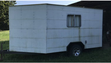
14' Self-contained camping trailer, AC