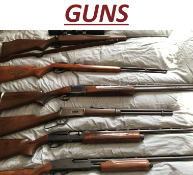
Remington 1100 Wingmaster 12 ga. trap, 2 ¾", rib barrel Remington 870 20 ga 2 ¾-3" Winchester 30-30 Browning Citori 12 ga o/u, 2 ¾", 28" barrel, w/ full set skeet, modified, improved, full chokes Revelation 22 model 120 LR, bolt Savage model 110 30-06 w/ var 4x16 scope Lot ammo and gun accessories