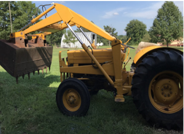
Massey 2135 Industrial tractor, dual hydraulics, w/loader 6' Blade fits Massey tractor Front tires and wheels for tractor 4 IHC weights