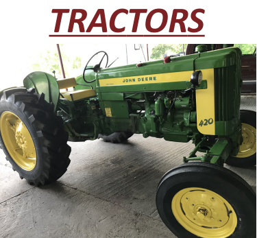
John Deere 420 tractor, power steering, dual hydraulics, Like new rubber, directional reverse, rare, good cond