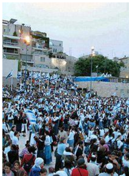
Jerusalem Day at the Western Wall (2004)

The Yakir Yerushalayim (Hebrew: יָקִיר יְרוּשָׁלַיִם; English: Worthy Citizen of Jerusalem) prize is awarded annually by the Jerusalem municipality on Jerusalem Day.