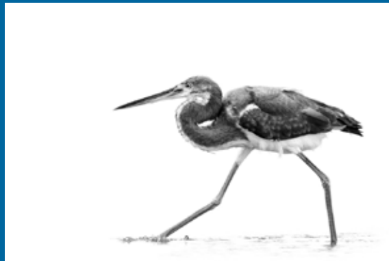
Best of Show Fine Art Series 3 Heron Cheryl Callen