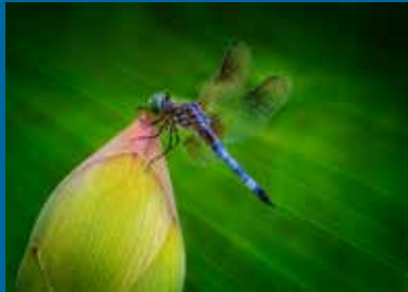
Best Color Blue Dasher Rose Epps