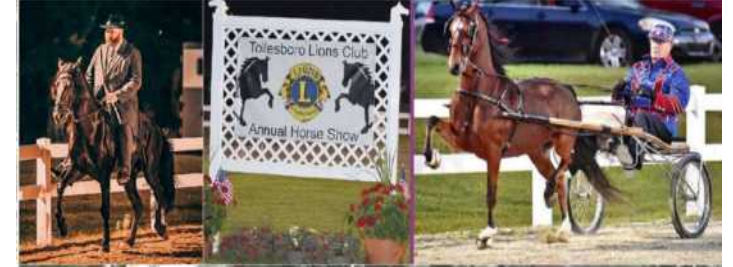
HORSE SHOW JULY 17 & 18, 2020