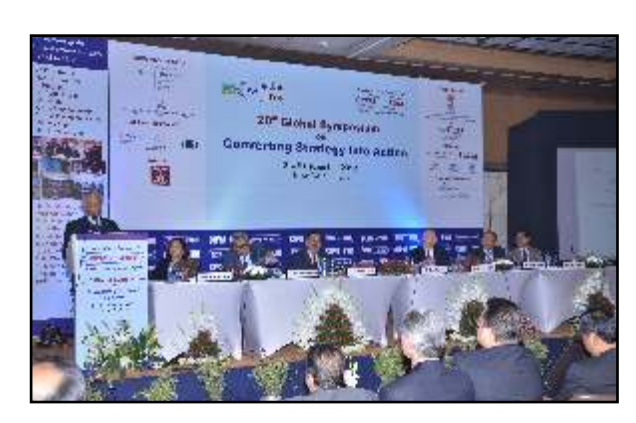
TKA Nair, Advisor to Prime Minister, giving the Special Address in the 20^{\text{th}} Global Symposium at its Inaugural Function. GS 2012 was attended by delegates from over 100 companies.