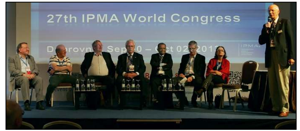
Photograph of some the Past Presidents of IPMA taken at the 27th IPMA World Congress from Sept. 28 - Oct. 1, 3013 at Dubrovnik, Croatia. IPMA supports PMA, India's initiative in creating a project oriented India.