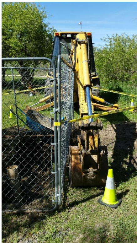
Working on the pump begins