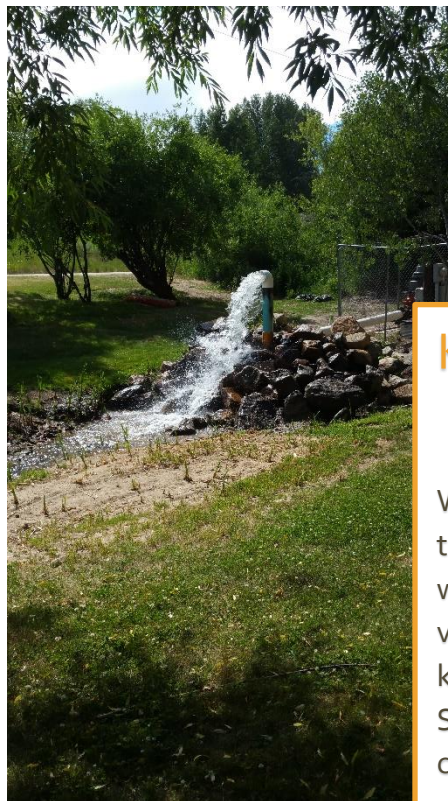
Pump Completed and waterfall work in progress