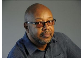
Leonard Pitts, Jr. Pulitzer Prize winning columnist