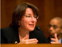
Amy Klobuchar U. S. Senator, D-MN