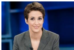
Rachel Maddow MSNBC talk show host

I would like to get to know these folks (to tell them how wrong they can be, of course), and I think they would somehow become respectful of me (and would probably point out my foolishness as well). I may revise this list as I think more about it. Please send me some of your “favorites” and I will consider adding them to my list.