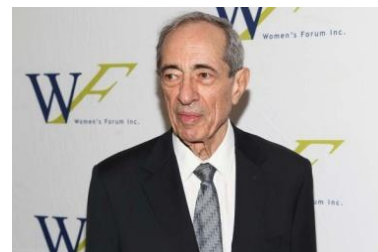
Mario Cuomo (recently deceased) – Former Democrat Mayor of NYC and Governor of NY

Last, I would like to make a comment about my selections. Note that all of them are currently active. Another person I also considered was Mario Cuomo whose funeral was this week. He really didn’t belong on this “current” list, but I thought he deserved honorable mention as someone I admired “way back when.” He was honest and sincere, and I loved to listen to him until that point in time when he attacked then President Reagan for trying to lift American Spirits through his “Shining City on the Hill” message. For that mistake, I subtracted points from Mr. Cuomo!