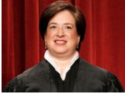
Elena Kagan Supreme Court Justice