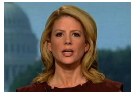
Kirsten Powers Political analyst, USA Today columnist and Fox News contributor