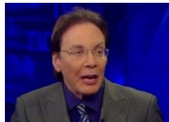
Alan Colmes Radio talk show host Former host, Fox News