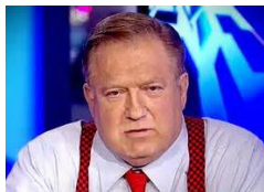
Bob Beckel Political pundit and former Democrat political operative Fox News political analyst

Following are those whose opinions I pay attention to because they are consistent and absolutely sincere – even though often misguided. I could probably come up with a few more, but this will give you an idea of how I'm thinking – plus, it's enough to get my conservative friends “up in arms”! I believe these people have earned and deserve my/our (somewhat reluctant perhaps) attention!