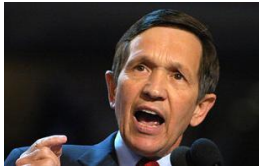
Dennis Kucinich Former U.S. Rep, D-Ohio