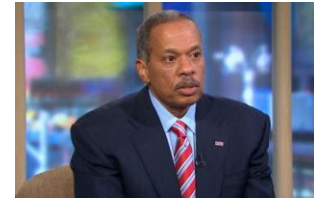
Juan Williams Journalist and Fox News political analyst