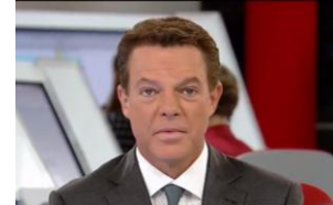
Shepherd Smith Fox News Anchor