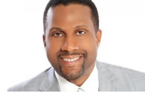
Tavis Smiley Talk show host