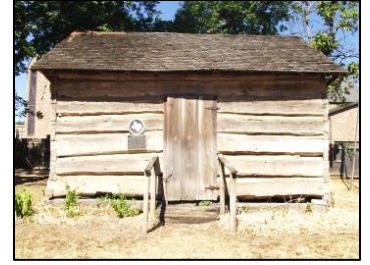
Potter Watson Cabin circa 1850s