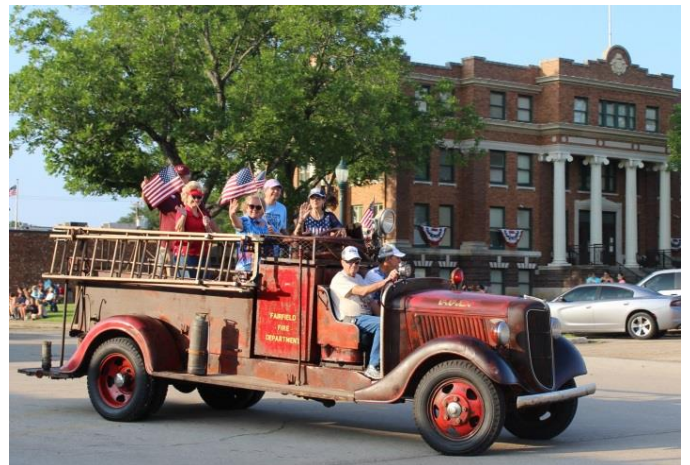
1936 Fairfield Fire Truck in the 2017 Freestone County Fair Parade