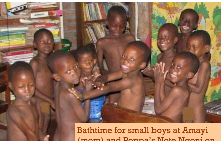
(mom) and Poppa's Note Ngoni on left doing Spiderman web shoot \O/ We have since moved the bathing to our Childrens bath house.

seeing enough come in to cover our costs. There is an average monthly budget posted on the web site and it shows how much and where funds are put to use. We need operating funds on a regular basis.......... Please be free give where your