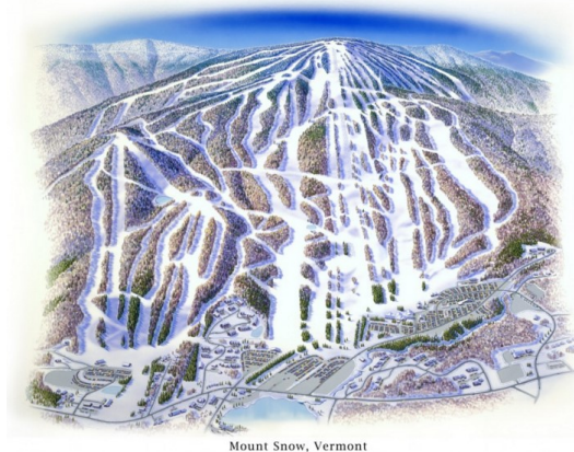
Mount Snow, Vermont