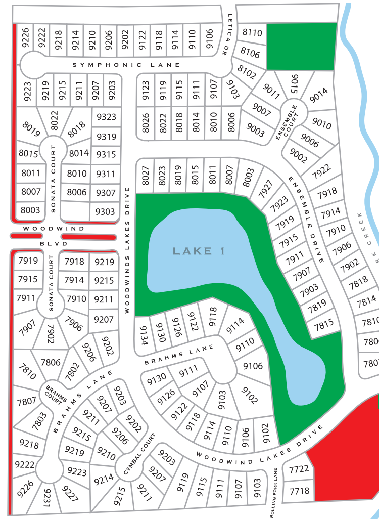
Section 1 — 150 Homes