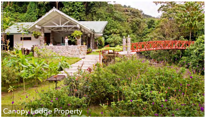
Canopy Lodge Property