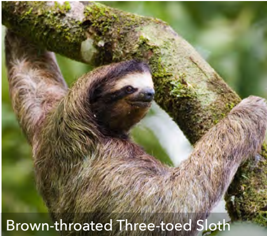
Brown-throated Three-toed Sloth