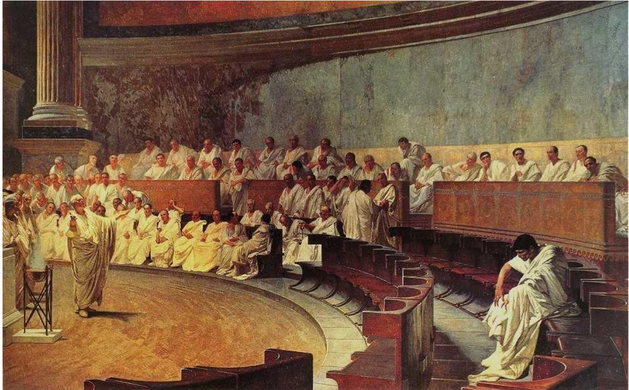
Cicero Denounces Catiline - Cesare Maccari, 1882-1888