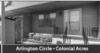
Arlington Circle • Colonial Acres