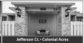
Jefferson Ct. • Colonial Acres