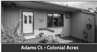
Adams Ct. • Colonial Acres

"We offer a competitive listing fee that we know would excite any seller"