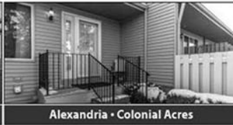
Alexandria • Colonial Acres