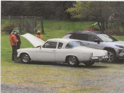
Above: Of course, there is always an inspection of the engine bay!