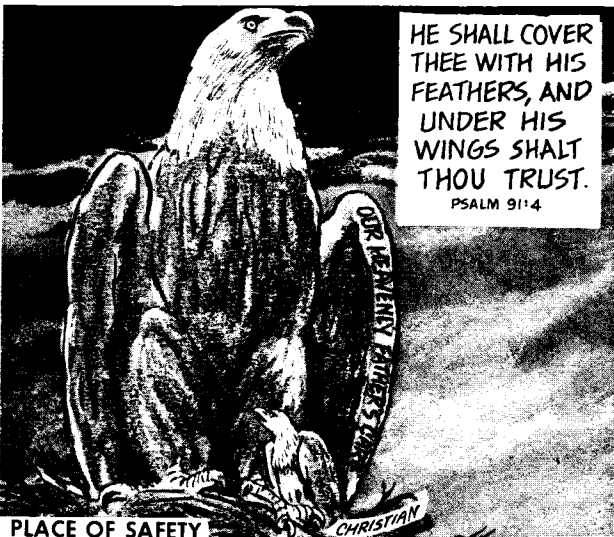
PLACE OF SAFETY

He that dwelleth in the secret place of the most high shall abide under the shadow of the almighty. I will say of the Lord, He is my refuge and my fortress: my God; in him will I trust. Surely he shall deliver thee from the snare of the fowler, and from the noisome pestilence. He shall cover thee with his feathers, and under his wings shalt thou trust: his truth shall be thy shield and buckler. Thou shalt not be afraid for the terror by night; nor for the arrow that flieth by day; Nor for the pestilence that walketh in darkness; nor for the destruction that wasteth at noonday. A thousand shall fall at thy side, and ten thousand at thy right hand; but it shall not come nigh thee. Only with thine eyes shalt thou behold and see the reward of the wicked. Because thou hast made the Lord, which is my refuge, even the most High, thy habitation; There shall no evil befall thee, neither shall any plague come nigh thy dwelling. For he shall give his angels charge over thee, to keep thee in all thy ways. They shall bear thee up in their hands, lest thou dash thy foot against a stone. Thou shalt tread upon the lion and adder: the young lion and the dragon shalt thou trample under feet. Because he hath set his love upon me, therefore will I deliver him: I will set him on high, because he hath known my name. He shall call upon me, and I will answer him: I will deliver him, and honor him. With long life will I satisfy him, and shew him my salvation. Psalm 91