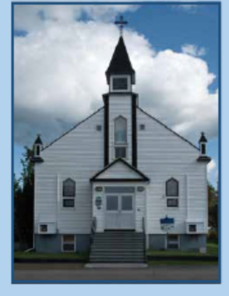
Our Lady of Mercy Pointe-du-Chêne

Parish Office: 340 Dominion Street, Moncton, NB E1C 6H8 Phone: 857-4223 Fax: 857-0020 Email: parish.office@qasmoncton.com