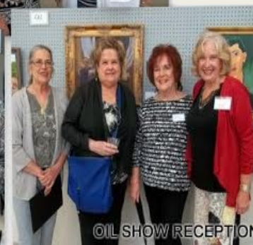
OIL SHOW RECEPTION