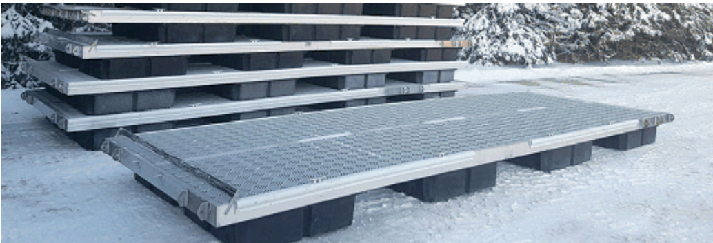
A first look at a piece of the new Waskesiu Lake Marina docks.