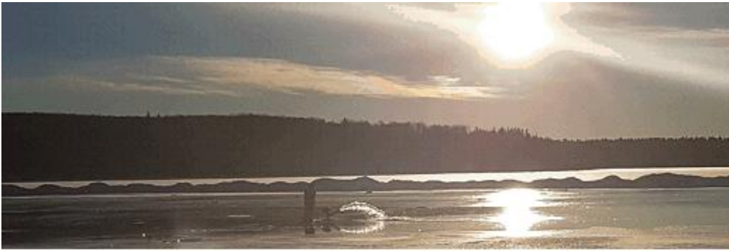
Building ice at the Waskesiu Lake Marina.