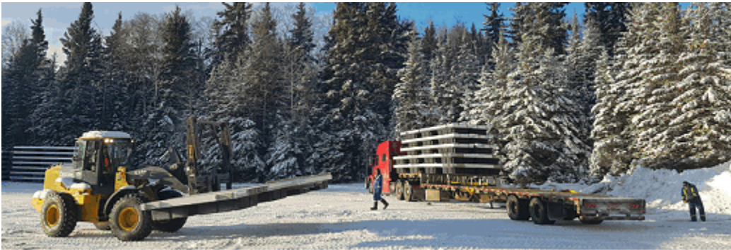
New docks arrive before installation begins later in February.