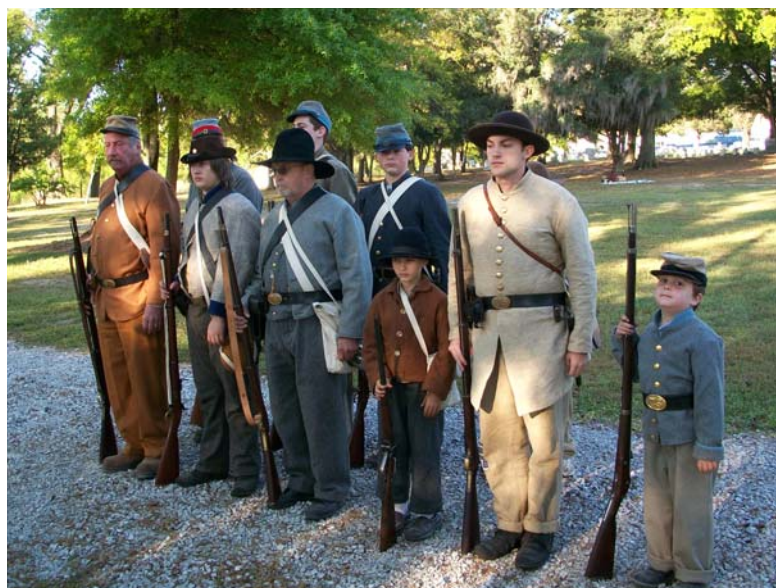
Some of the Recruits at the 2010 Spring Bivouac. Thanks to all who came and made this event a success!

Mississippi Division, Sons of Confederate Veterans