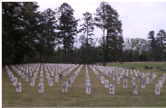
Vandalized Confederate graves